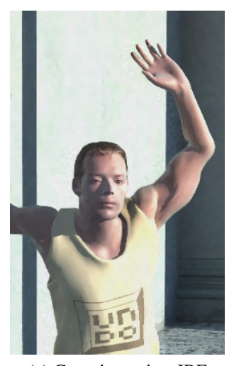
(a) Gaussian noise, JBF

As the graph based approach involves eigen decomposition, GB-JBF would incur higher complexity than JBF. Fortunately, with the GB-JBF implemented in this paper, we employed a local graph for each pixel and the graph size is limited by the range of the neighborhood pixels, which is selected as 7 \times 7 window (instead of 3 \times 3 as in Fig. 1). With a MAT-LAB implementation and the selected parameters in the above tests, GB-JBF takes about 20% more run time than JBF.