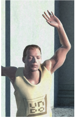
(b) Gaussian noise, GB-JBF