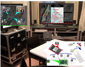
Figure 7. Top: normal appearance of WIM. Bottom: WIM has animated to the 'meta' level, showing the space as a whole.