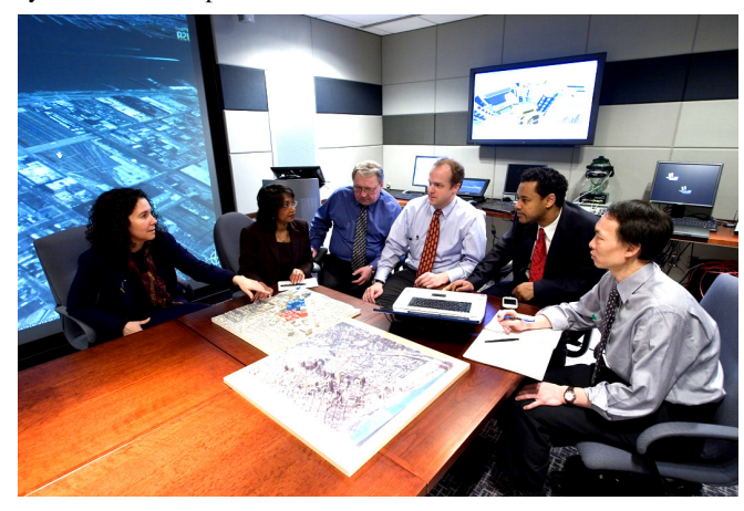
Figure 1. The PB Cave (<u>www.pb.com</u>). A space containing many elements of our envisioned environment.

We begin by reviewing related work, then present six design requirements for the building of an effective table-centred control space which includes multiple ancillary vertical displays. Finally, we present the design solutions which made-up a prototype system we developed.