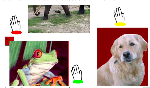
Figure 6. Each user's point of contact on one or more WIMs is shown on ancillary displays, uniquely identified by colour.

As described previously, we wished to facilitate the use of the WIM as an input-only space, allowing users to use the larger, ancillary displays as their visual focus. Further, we felt it necessary to provide peripheral observers not seated at the table with cues to facilitate their understanding of operations being performed on the ancillary displays. To support these goals, we added pointers to the ancillary display: whenever a user was touching the WIM, the corresponding point on the ancillary display would show a pointer, as depicted in Figure 6. We augmented these pointers with a colour coding to uniquely identify the actions of each user. These pointers can also be used by participants as a visual reference point for discussion (e.g., "look at this"), and also to reduce interference with concurrent tasks performed on the ancillary displays, by providing other users with awareness of the current focus of one's work.